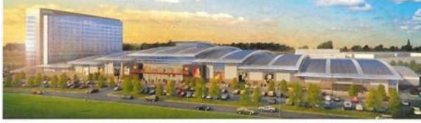
AVAILABLE LAND LOCATED DIRECTLY SOUTH ACROSS THE ROAD FROM NEW HORIZON MALL